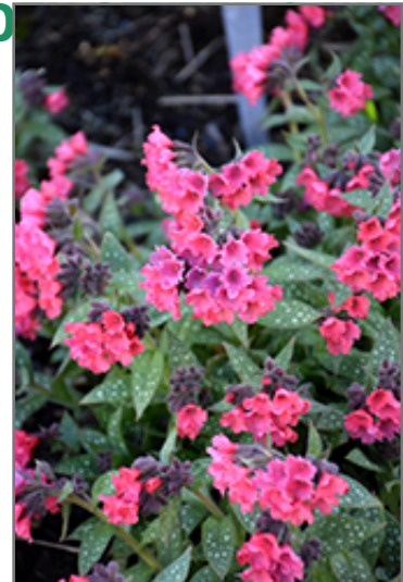
Shrimps On The Barbie Lungwort flowers