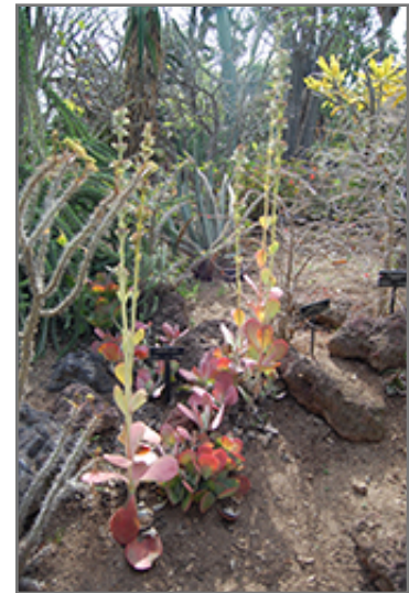
Paddle Plant in bloom