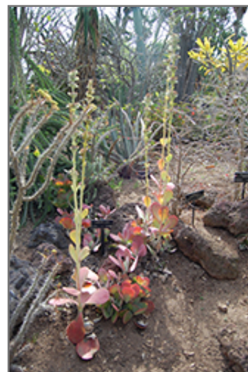
Paddle Plant in bloom