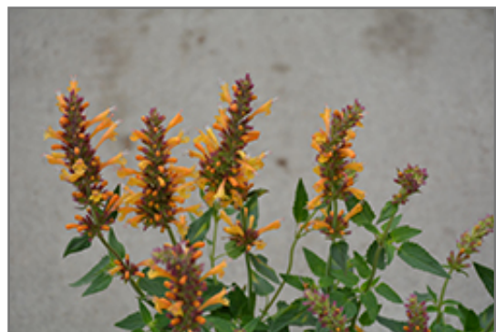
Kudos Gold Hyssop flowers