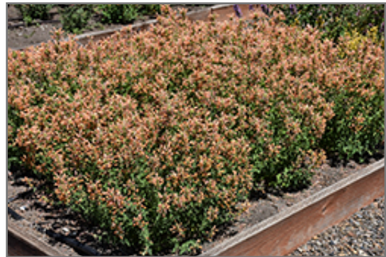
Kudos Gold Hyssop in bloom