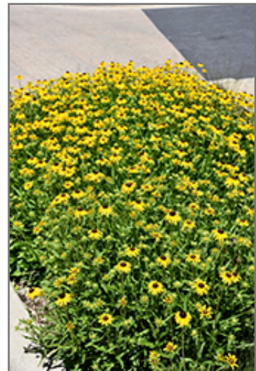
Viette's Little Suzy Coneflower in bloom