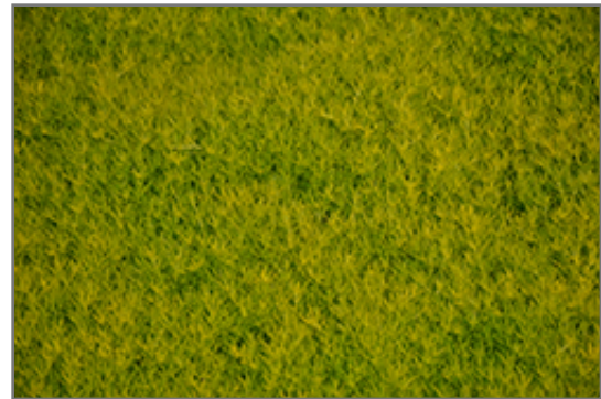
Scotch Moss foliage