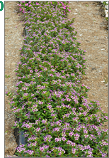
Soiree Kawaii Blueberry Kiss Vinca in bloom