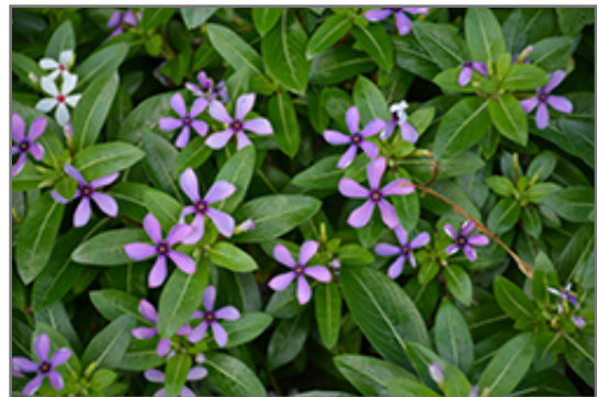
Soiree Kawaii Blueberry Kiss Vinca flowers