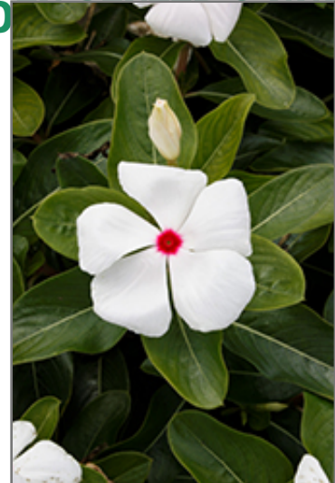
Cora Cascade Polka Dot Vinca flowers