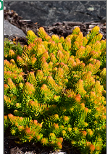
Angelina Stonecrop foliage