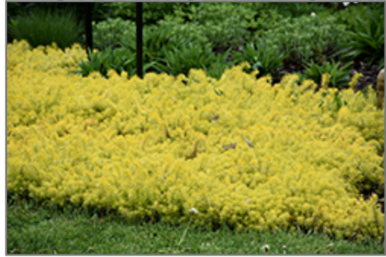
Angelina Stonecrop

This plant does best in full sun to partial shade. It prefers dry to average moisture levels with very well-drained soil, and will often die in standing water. It is considered to be drought-tolerant, and thus makes an ideal choice for a low-water garden or xeriscape application. It is not particular as to soil pH, but grows best in poor soils, and is able to handle environmental salt. It is highly tolerant of urban pollution and will even thrive in inner city environments. This is a selected variety of a species not originally from North America. It can be propagated by division; however, as a cultivated variety, be aware that it may be subject to certain restrictions or prohibitions on propagation.