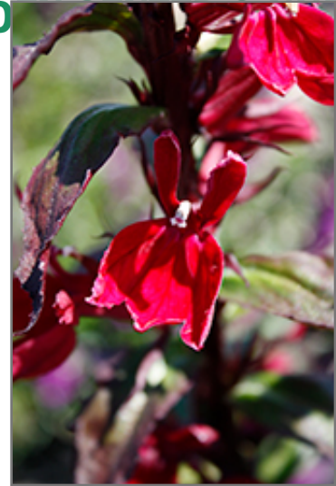
Starship Burgundy Lobelia flowers