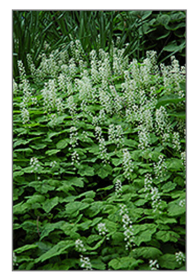
Creeping Foamflower in bloom