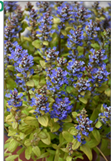
Feathered Friends Fancy Finch Bugleweed flowers