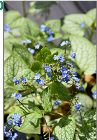
Jack of Diamonds Bugloss flowers