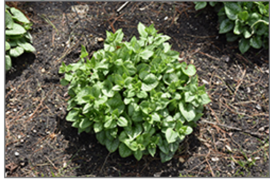
Jack of Diamonds Bugloss

Jack of Diamonds Bugloss will grow to be about 14 inches tall at maturity, with a spread of 30 inches. When grown in masses or used as a bedding plant, individual plants should be spaced approximately 28 inches apart. It grows at a medium rate, and under ideal conditions can be expected to live for approximately 10 years. As an herbaceous perennial, this plant will usually die back to the crown each winter, and will regrow from the base each spring. Be careful not to disturb the crown in late winter when it may not be readily seen!