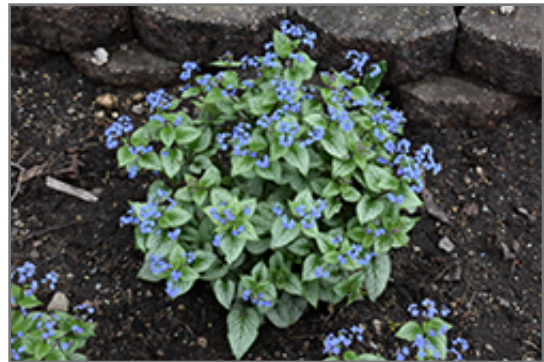
Sterling Silver Bugloss in bloom