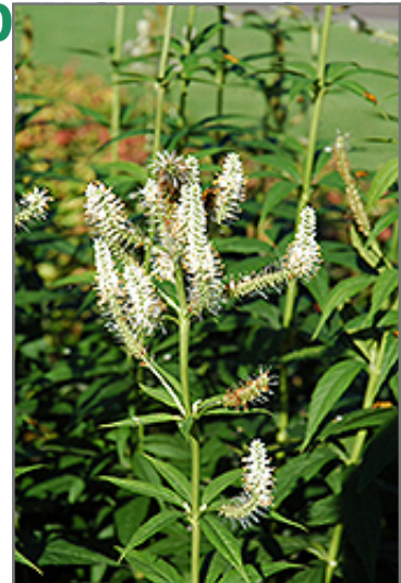
Culver's Root flowers

This plant does best in full sun to partial shade. It requires an evenly moist well-drained soil for optimal growth. It is not particular as to soil type or pH. It is somewhat tolerant of urban pollution. This species is native to parts of North America. It can be propagated by division.