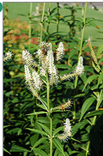
Culver's Root flowers

This plant does best in full sun to partial shade. It requires an evenly moist well-drained soil for optimal growth. It is not particular as to soil type or pH. It is somewhat tolerant of urban pollution. This species is native to parts of North America. It can be propagated by division.