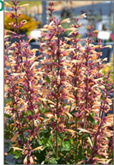
Meant To Bee Queen Nectarine Anise Hyssop flowers