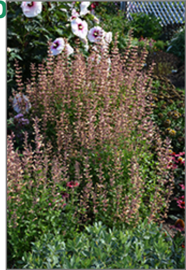
Meant To Bee Queen Nectarine Anise Hyssop in bloom