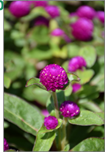
Gnome Purple Gomphrena flowers