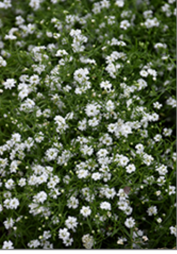
Filou White Creeping Baby's Breath flowers

Filou White Creeping Baby's Breath has masses of beautiful clusters of white star-shaped flowers at the ends of the stems from early to mid summer, which are most effective when planted in groupings. Its grassy leaves remain bluish-green in color throughout the season.