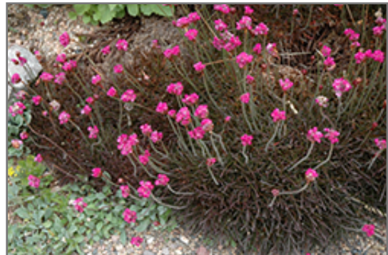
Red-leaved Sea Thrift in bloom