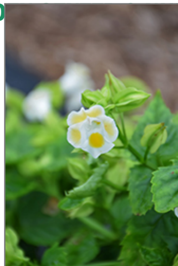
Kauai Lemon Drop Torenia flowers