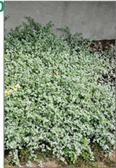
Silver Licorice Plant