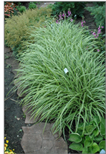
Ice Dance Sedge