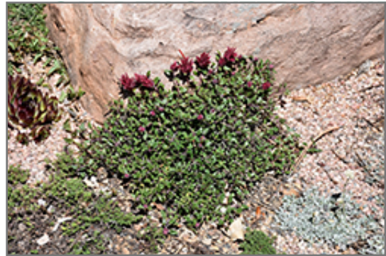
Marian Sampson Scarlet Monardella in bloom

Marian Sampson Scarlet Monardella will grow to be only 3 inches tall at maturity extending to 5 inches tall with the flowers, with a spread of 12 inches. When grown in masses or used as a bedding plant, individual plants should be spaced approximately 8 inches apart. Its foliage tends to remain low and dense right to the ground. It grows at a medium rate, and under ideal conditions can be expected to live for approximately 3 years. As an evergreen perennial, this plant will typically keep its form and foliage year-round.