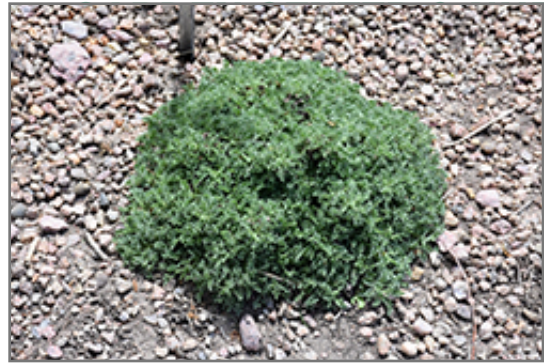
Carpeting Pincushion Flower

Carpeting Pincushion Flower is a fine choice for the garden, but it is also a good selection for planting in outdoor pots and containers. Because of its spreading habit of growth, it is ideally suited for use as a 'spiller' in the 'spiller-thriller-filler' container combination; plant it near the edges where it can spill gracefully over the pot. Note that when growing plants in outdoor containers and baskets, they may require more frequent waterings than they would in the yard or garden.