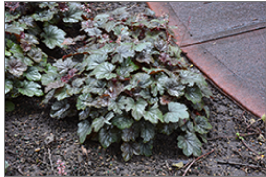
Steel City Coral Bells

Steel City Coral Bells will grow to be about 12 inches tall at maturity, with a spread of 24 inches. Its foliage tends to remain dense right to the ground, not requiring facer plants in front. It grows at a medium rate, and under ideal conditions can be expected to live for approximately 10 years. As an evergreen perennial, this plant will typically keep its form and foliage year-round.