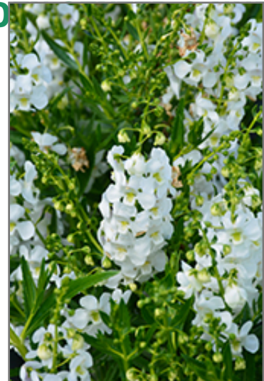
Angelwings White Angelonia flowers