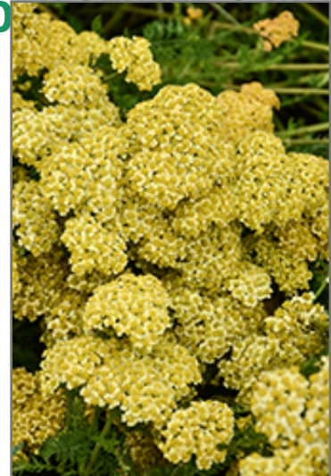
Milly Rock Yellow Terracotta Yarrow flowers