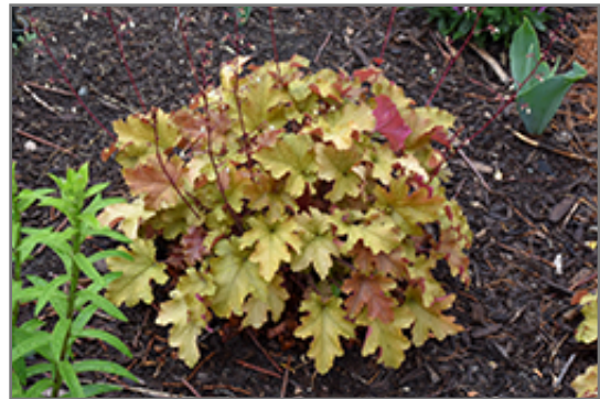
Marmalade Coral Bells