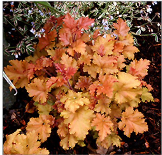
Marmalade Coral Bells foliage

Marmalade Coral Bells is a fine choice for the garden, but it is also a good selection for planting in outdoor pots and containers. It is often used as a 'filler' in the 'spiller-thriller-filler' container combination, providing a mass of flowers and foliage against which the larger thriller plants stand out. Note that when growing plants in outdoor containers and baskets, they may require more frequent waterings than they would in the yard or garden.