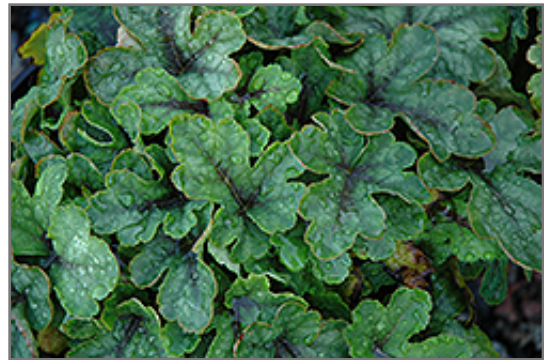
Dayglow Pink Foamy Bells foliage