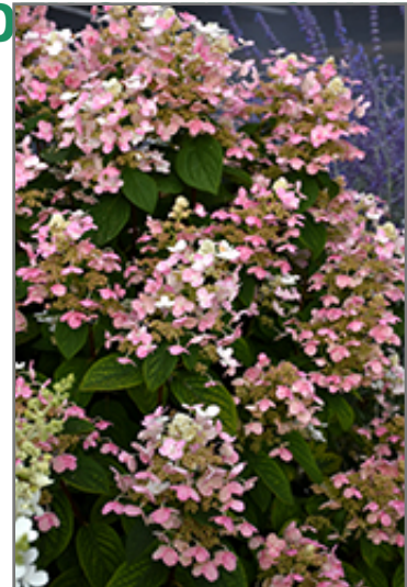
Quick Fire Hydrangea flowers

Quick Fire Hydrangea will grow to be about 10 feet tall at maturity, with a spread of 10 feet. It tends to be a little leggy, with a typical clearance of 2 feet from the ground, and is suitable for planting under power lines. It grows at a medium rate, and under ideal conditions can be expected to live for 40 years or more.