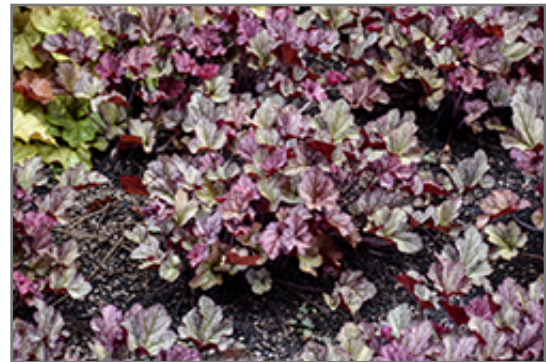
Coralberry Coral Bells