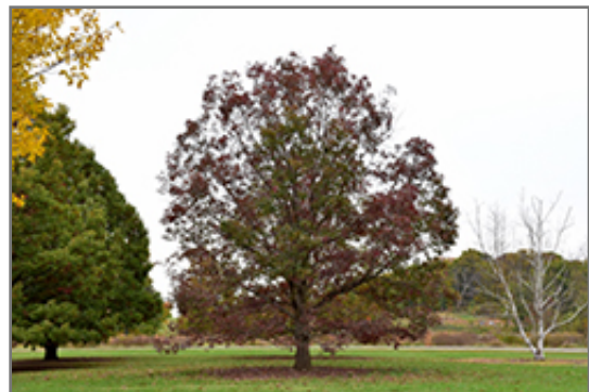
White Oak in fall