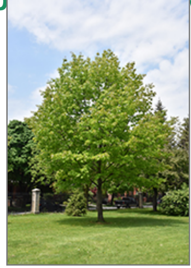
Red Oak