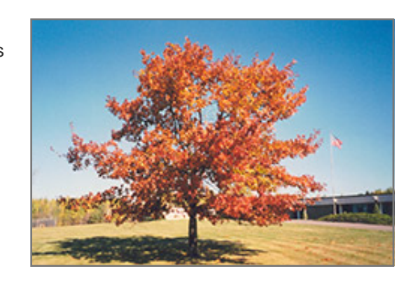
Red Oak in fall