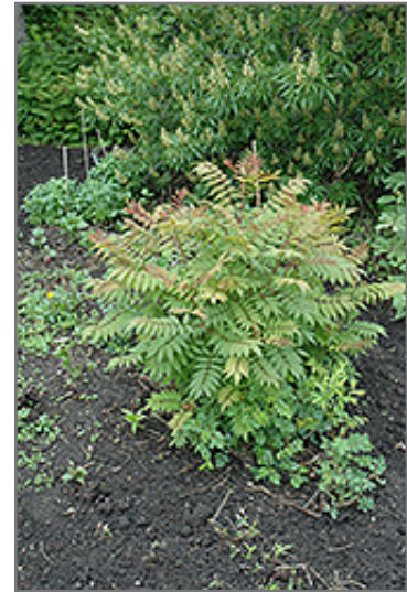
Sem False Spirea