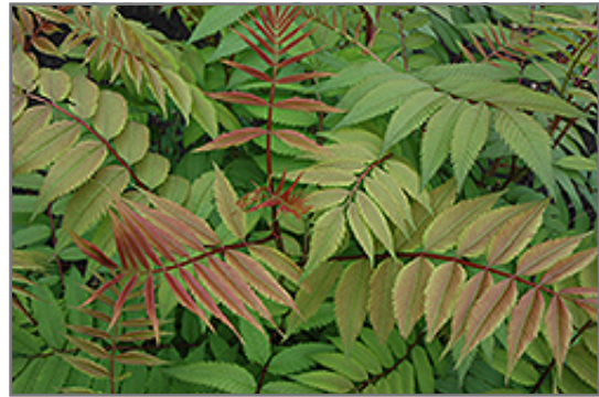
Sem False Spirea foliage