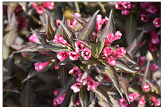
Midnight Wine Weigela flowers