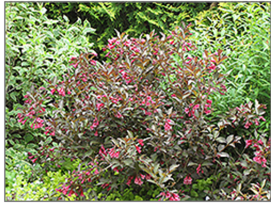
Midnight Wine Weigela in bloom