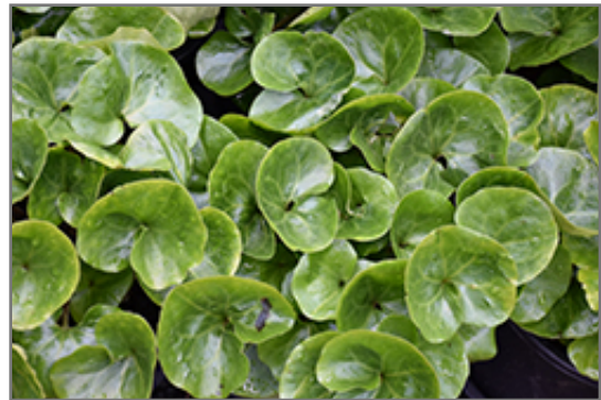
European Wild Ginger foliage