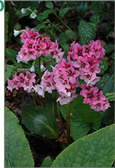
Pink Dragonfly Bergenia flowers

Pink Dragonfly Bergenia will grow to be about 15 inches tall at maturity, with a spread of 18 inches. Its foliage tends to remain dense right to the ground, not requiring facer plants in front. It grows at a medium rate, and under ideal conditions can be expected to live for approximately 10 years. As an evergreen perennial, this plant will typically keep its form and foliage year-round.