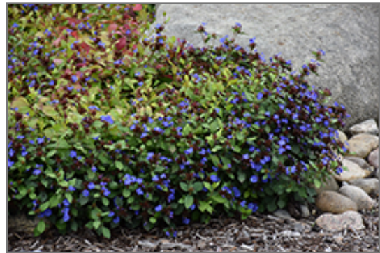
Plumbago in bloom