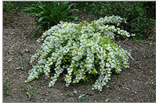
Chardonnay Pearls Deutzia in bloom