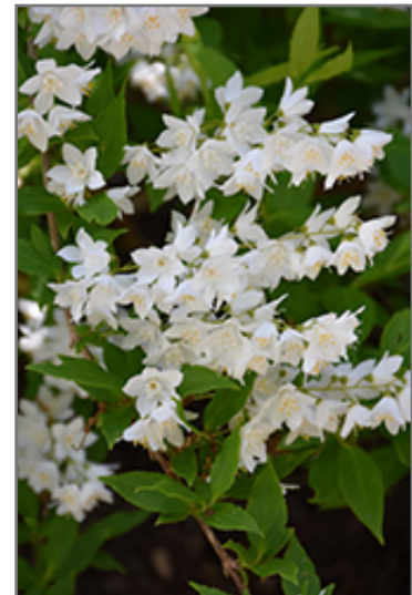
Chardonnay Pearls Deutzia flowers