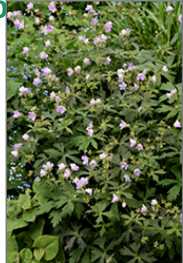
Espresso Cranesbill in bloom

Espresso Cranesbill is a fine choice for the garden, but it is also a good selection for planting in outdoor pots and containers. It is often used as a 'filler' in the 'spiller-thriller-filler' container combination, providing a mass of flowers and foliage against which the thriller plants stand out. Note that when growing plants in outdoor containers and baskets, they may require more frequent waterings than they would in the yard or garden.