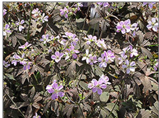
Espresso Cranesbill flowers