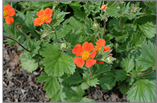
Boris Avens flowers