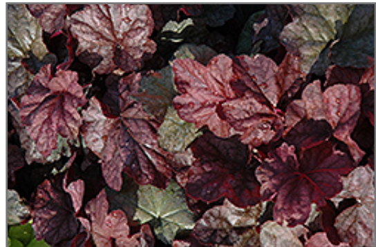
Beaujolaï Hairy Alumroot foliage