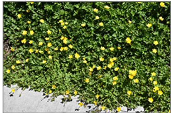
Barren Strawberry in bloom