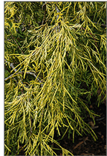
Lemon Thread Falsecypress foliage