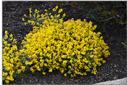
Bangle Dyers Greenwood in bloom

Bangle Dyers Greenwood will grow to be about 24 inches tall at maturity, with a spread of 3 feet. It tends to fill out right to the ground and therefore doesn't necessarily require facer plants in front. It grows at a slow rate, and under ideal conditions can be expected to live for approximately 20 years.