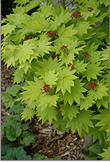
Golden Fullmoon Maple foliage

Golden Fullmoon Maple will grow to be about 20 feet tall at maturity, with a spread of 20 feet. It has a low canopy with a typical clearance of 3 feet from the ground, and is suitable for planting under power lines. It grows at a slow rate, and under ideal conditions can be expected to live to a ripe old age of 100 years or more; think of this as a heritage tree for future generations!