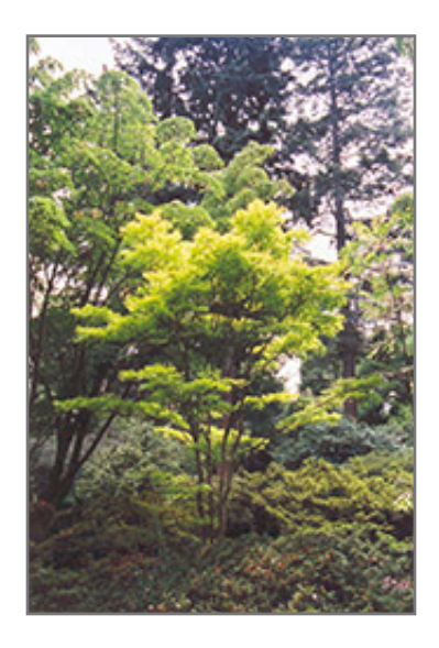
Golden Fullmoon Maple