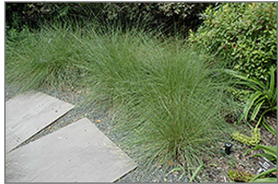
Hairawn Muhly