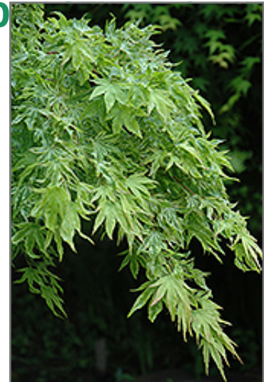
Higasa Yama Japanese Maple foliage

Higasa Yama Japanese Maple will grow to be about 15 feet tall at maturity, with a spread of 15 feet. It has a low canopy with a typical clearance of 2 feet from the ground, and is suitable for planting under power lines. It grows at a slow rate, and under ideal conditions can be expected to live for 60 years or more.