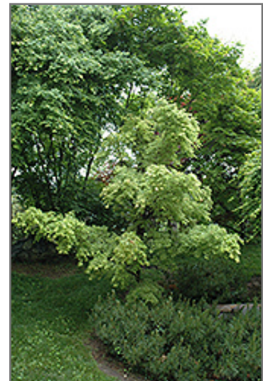
Higasa Yama Japanese Maple