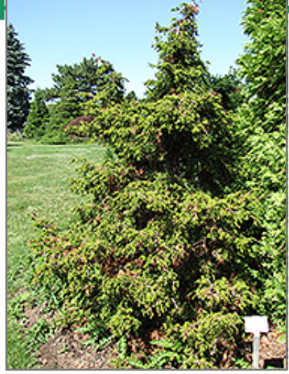
Torulosa Dwarf Hinoki Falsecypress