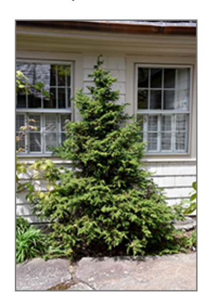
Torulosa Dwarf Hinoki Falsecypress