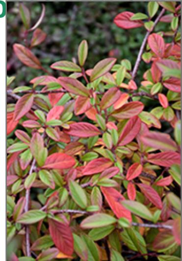
Scarlet Leader Willowleaf Cotoneaster in fall

This shrub does best in full sun to partial shade. It is very adaptable to both dry and moist growing conditions, but will not tolerate any standing water. It is not particular as to soil type or pH, and is able to handle environmental salt. It is highly tolerant of urban pollution and will even thrive in inner city environments. This is a selected variety of a species not originally from North America.