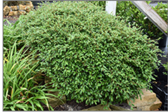
Scarlet Leader Willowleaf Cotoneaster