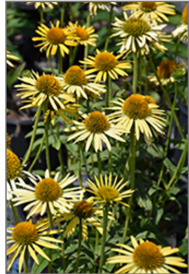
Maui Sunshine Coneflower flowers